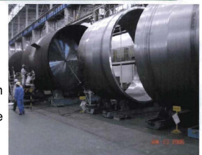
S/G 3A Lower and Middle Shell S/G 2A Balance Ring, Extension Ring, & Tubesheet